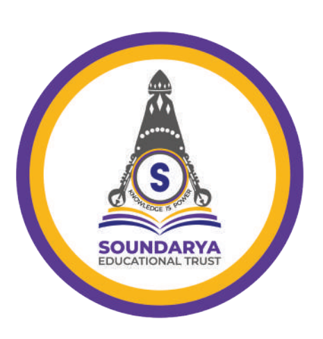
CEO'S MESSAGE Empowering Legal Minds for a Just Society

At Soundarya College of Law, we are dedicated to shaping a generation of legal professionals who not only academically but also integrity, empathy, and a commitment to social justice. We believe that a true education extends beyond the classroom; it requires a deep engage with real-world issues, thinking, and a dedication to ethical practice. Our programs blend rigorous academics with hands-on learning and community outreach, all aimed fostering a profound understanding of the law's role in shaping society. We invite you to join us on this journey of knowledge, growth, and impact as we cultivate leaders who are prepared to advocate for positive change